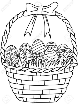
an Easter basket